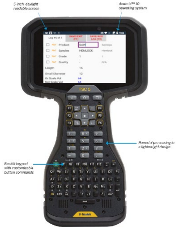
Caribou Log Scaling Application

Finally, for mills that scale each log, Caribou’s new Android-based Log Scaling app integrates seamlessly with the Cutting-Edge payment system via wi-fi. If you are one of the many mills still limping along with antiquated, but mission-critical handheld devices and software built on technology that is no longer supported, Caribou can help you modernize this critical data collection process.